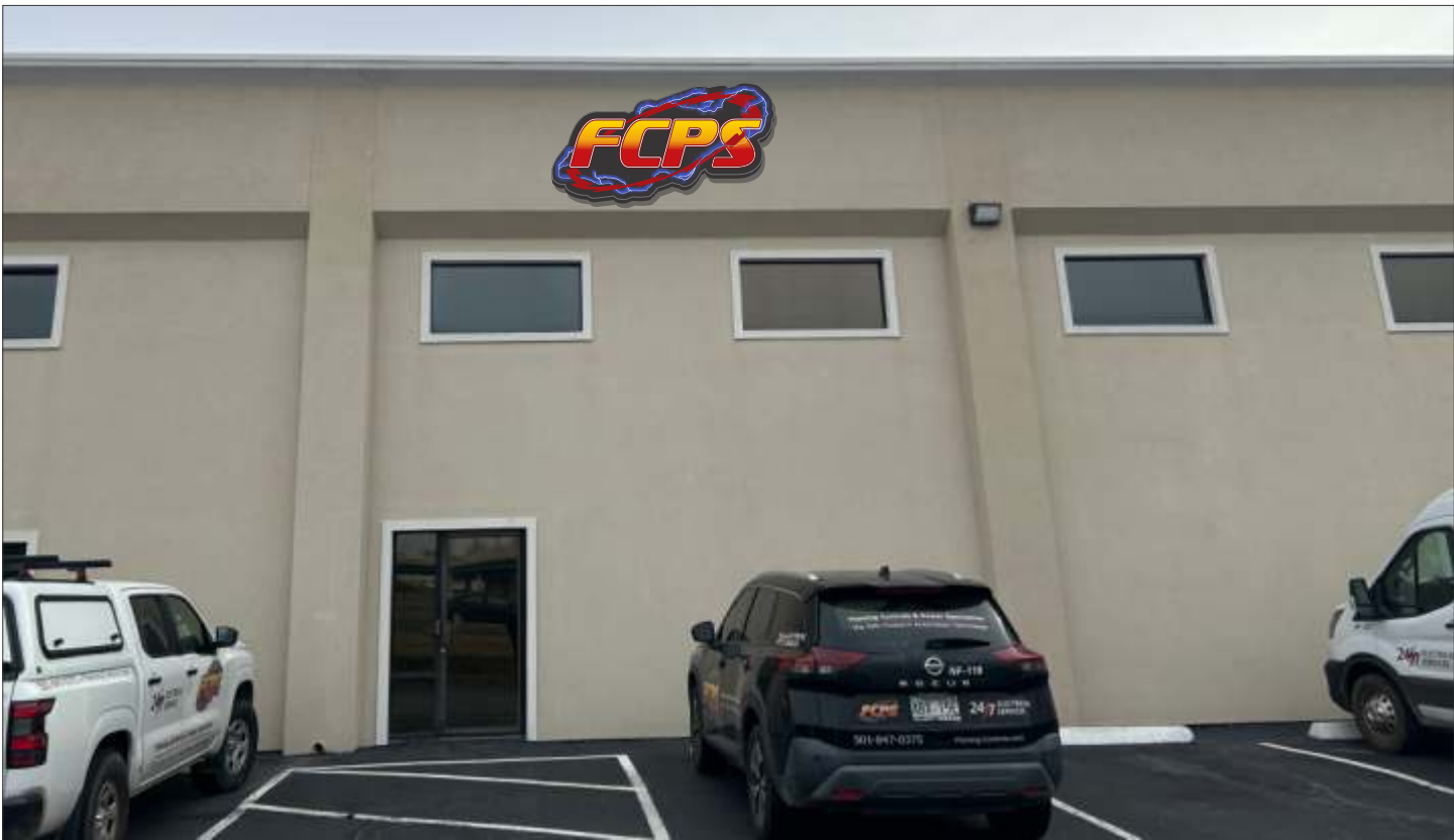
PROPOSED ELEVATION SCALE NTS