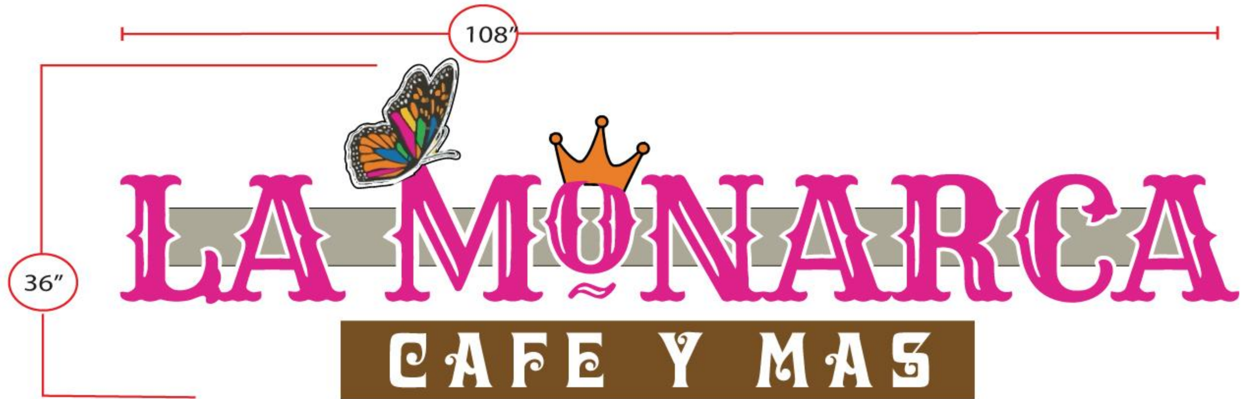
RACEWAY MOUNTED FACE LIT CHANNEL LETTERS