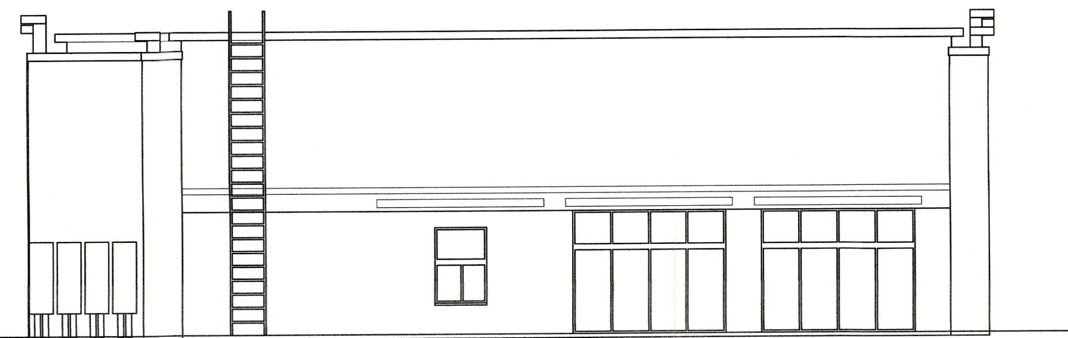
Side, North Elevation