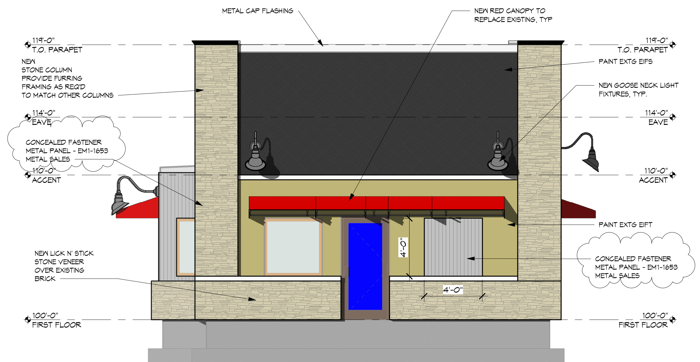
3 SOUTH ELEVATION 1/4" = 1'-0"