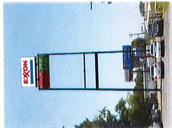
SCALE: 3/32 " = 1'-0" PROPOSED