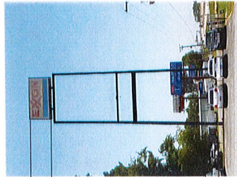
SCALE: 3/32 " = 1'-0"