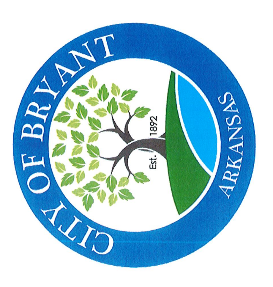
Financial Statements February 2023