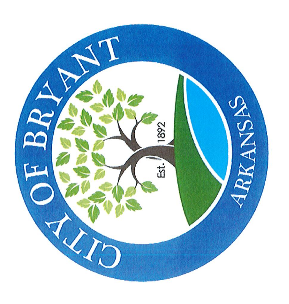
Financial Statements March 2023