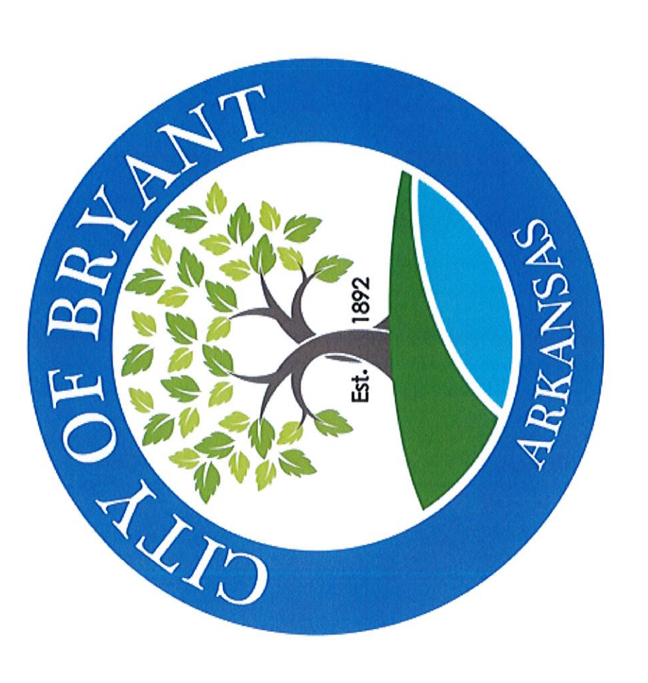
Financial Statements January 2024