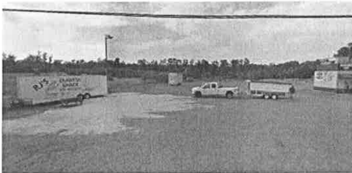
Currently shown: Jun 2019